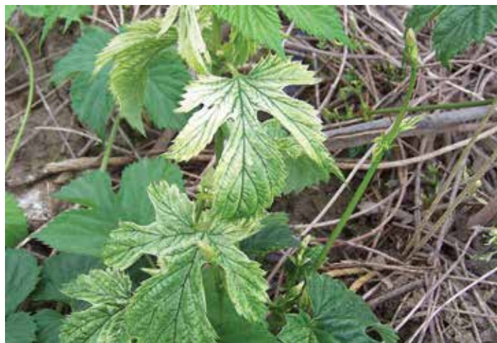
Figure 253. Severe chlorosis of leaves impacted by glyphosate, in which the areas between the leaf veins are bleached to almost white.