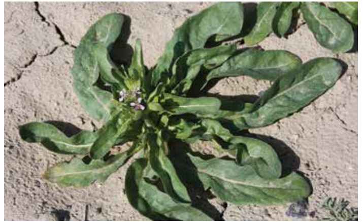
Figure 232. Blue mustard plant. (R.A. Boydston)