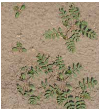
Figure 200. Puncturevine seedlings. (R. Parker)