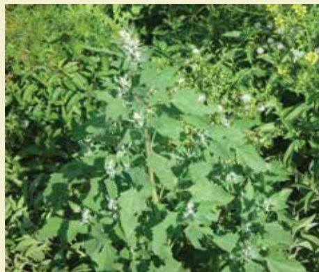
Figure 187. Lambsquarters. (R. Parker)