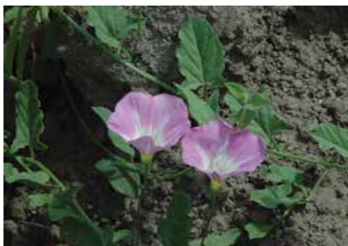
Figure 220. Field bindweed flowers. See also plant, Figure 191. (R. Parker)