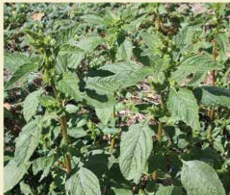
Figure 189. Pigweed. (R.A. Boydston)