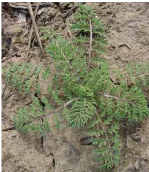
Figure 205. Flixweed seedling. (R.A. Boydston)