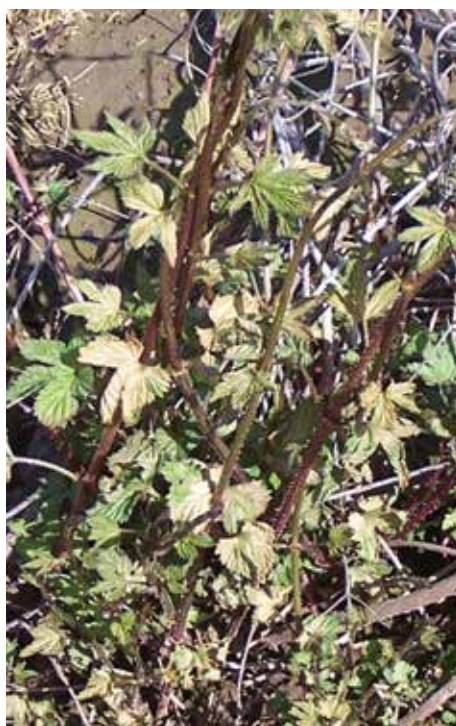
Figure 255. Yellowing and death of leaves caused by paraquat applied for spring pruning during cold weather. (D.H. Gent)