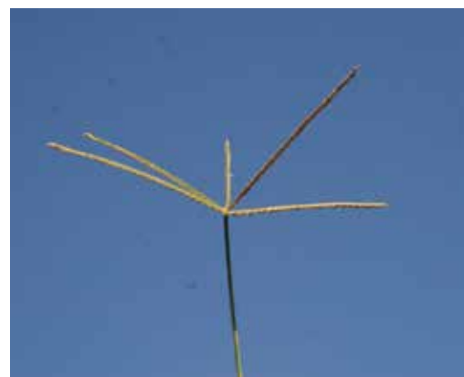
Figure 243. Bermudagrass inflorescence. (R. Parker)