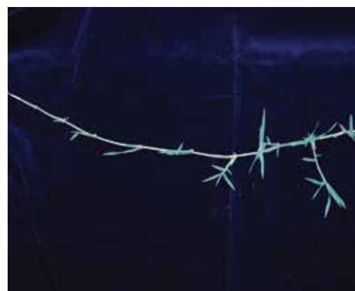
Figure 244. Bermudagrass stolon.