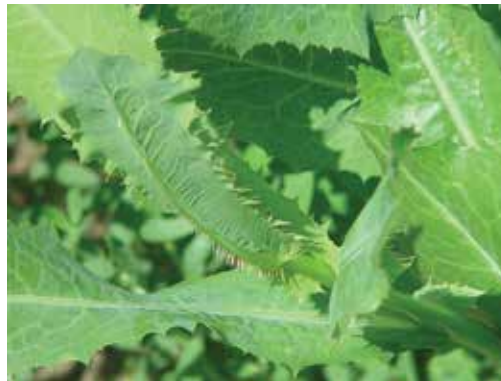
Figure 210. Prickly lettuce leaves. (R. Parker)

Organic mulches have been utilized in some organic hop yards to suppress weeds. Growing a cover crop and then mowing it and blowing the residues onto the hop crowns can suppress annual weeds. However, use of organic mulches can also have impacts—both positive and negative—on insect pests, voles, or plant pathogens. Synthetic mulches may also be useful in certain situations to suppress weeds, but are not widely used in conventionally grown hop yards.