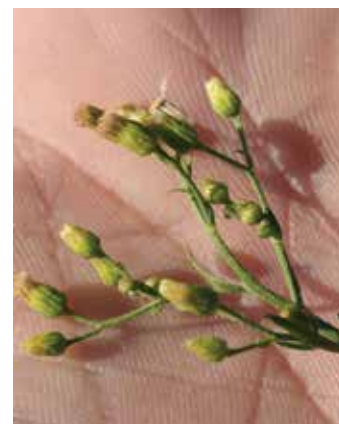
Figure 223. Horseweed inflorescence. (R. Parker)