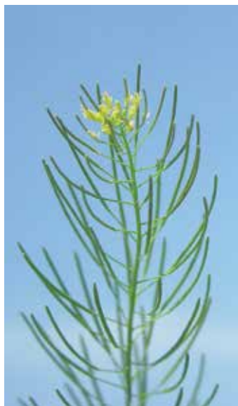
Figure 236. Flixweed inflorescence.

Herbicide rates on an herbicide label are usually given in pounds, pints, or quarts per acre. An acre is equal to 43,560 square feet. Herbicides in hop yards, particularly foliage desiccant control products, frequently are applied in bands over the row. Confusion commonly occurs in interpreting how much herbicide should be applied when the herbicide is used to treat only a portion of each field. To illustrate this, if a 4-foot band is applied only over the row, 10,890 feet, or 3,630 yards, of row would have to be treated to equal one treated or broadcast-sprayed acre. If hop plants were in rows spaced 14 feet apart and the herbicide label indicates the herbicide is to be applied at 2 pints per acre, then 2 pints of herbicide is enough to treat 3.5 field acres of hop plants. Since 2 pints equal 32 fluid ounces, each planted acre of hop will receive only 9.14 fluid ounces of herbicide.