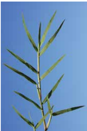
Figure 227. Bermudagrass is a perennial grass weed. (R.A. Boydston)