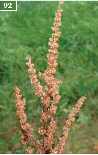
Figure 225. Curly dock inflorescence. It is a perennial broadleaf weed. (M.A. Goll)