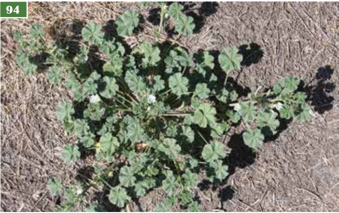
Figure 228. Common mallow. (R.A. Boydston)