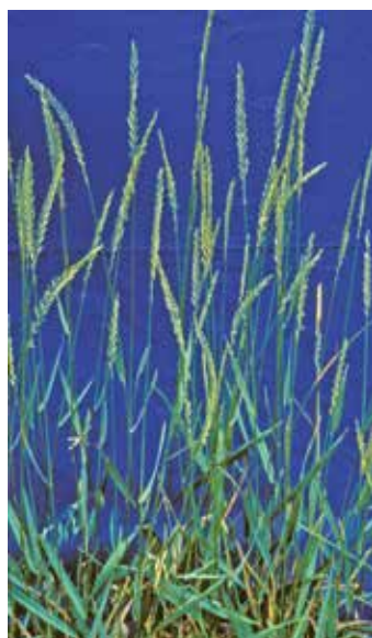
Figure 238. Quackgrass.