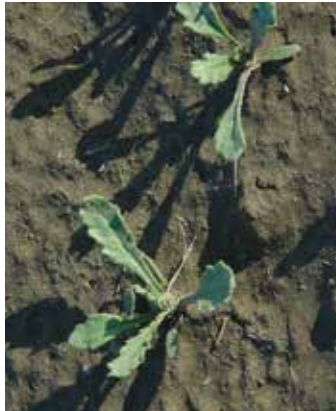
Figure 194. Common groundsel seedlings. (R. Parker)