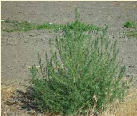
Figure 188. Kochia. (R. Parker)