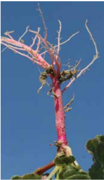
Figure 208. Aptly named red-root pigweed root. (R. Parker)