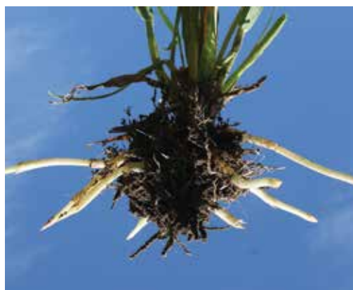
Figure 240. Quackgrass rhizomes. (R.A. Boydston)