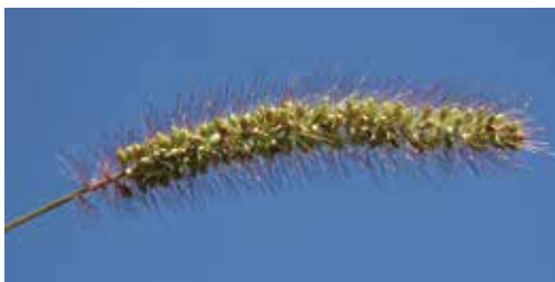
Figure 218. Green foxtail inflorescence.