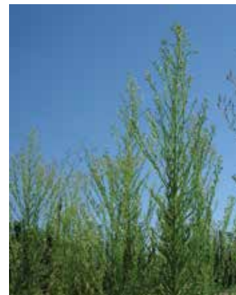
Figure 222. Mature horseweed plants. (R. Parker)