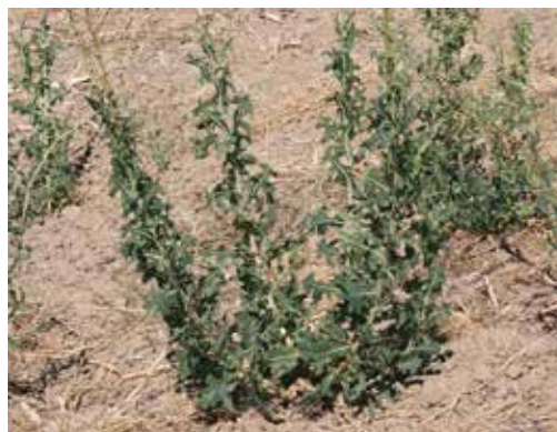
Figure 211. Mature prickly lettuce plant. See also Figures 185 and 206. (R. Parker)