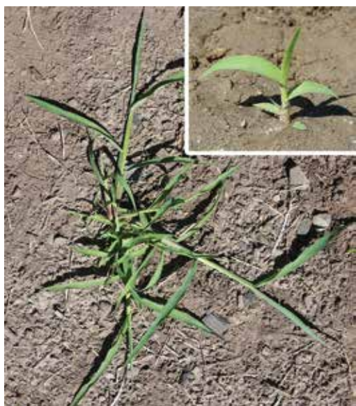
Figure 203. Barnyardgrass seedlings. (R.A. Boydston)