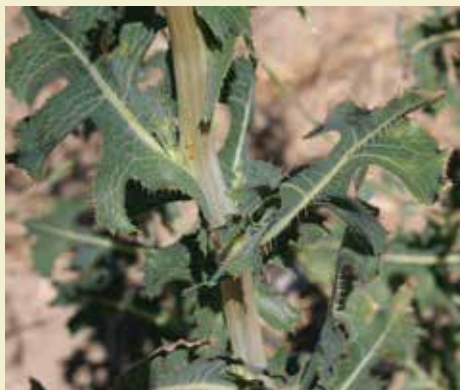
Figure 186. Prickly lettuce. (R. Parker)