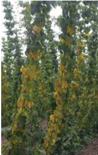
Figure 246. Chlorotic (yellow) leaf tissue due to carfentrazone.