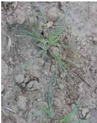
Figure 195. Russian thistle seedlings. (R.A. Boydston)