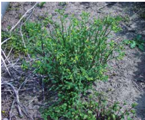
Figure 216. Common groundsel.

Once new hop plants have been strung and are approximately 6 feet tall, weeds can be suppressed with contact herbicides such as paraquat (Gramoxone) or carfentrazone (Aim).