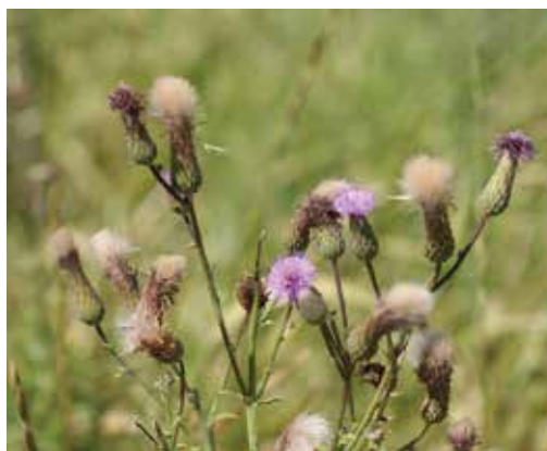
Figure 239. Mature inflorescence of Canada thistle. See also Figure 190.