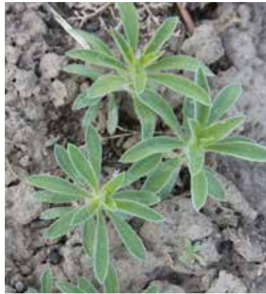
Figure 197. Kochia seedlings. (R.A. Boydston)