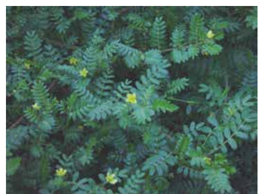
Figure 213. Puncturevine plant. (R. Parker)