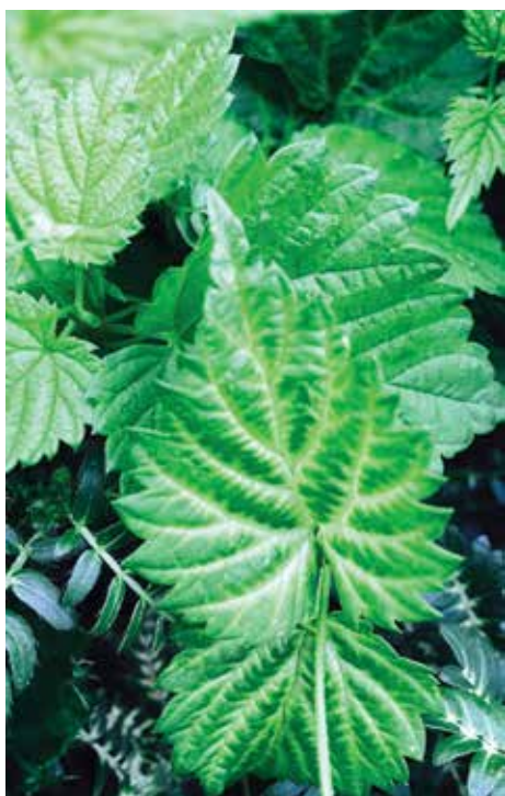
Figure 254. Leaf veins bleach yellow to white when injured by norflurazon, but plants generally recover. (D.H. Gent)