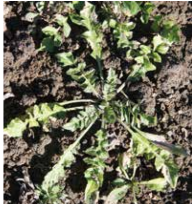
Figure 198. Shepherd's purse seedling.