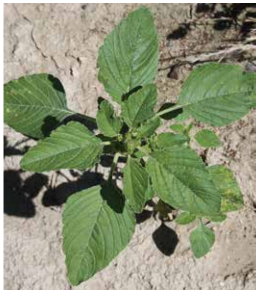
Figure 202. Pigweed seedling. (R.A. Boydston)