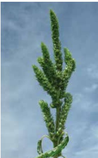
Figure 209. Powell amaranth is a pigweed species distinguished by its longer, slimmer inflorescence.