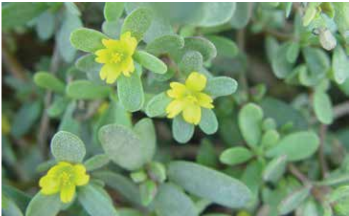
Figure 230. Common purslane flowers.