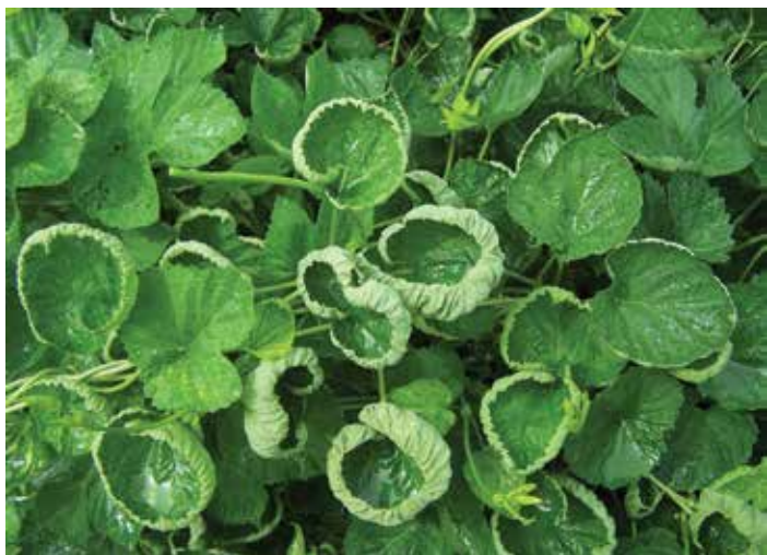
Figure 250. Severe cupping of leaves due to high rate of clopyralid applied to control Canada thistle. (D.H. Gent)