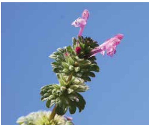
Figure 219. Henbit flower. (R.A. Boydston)