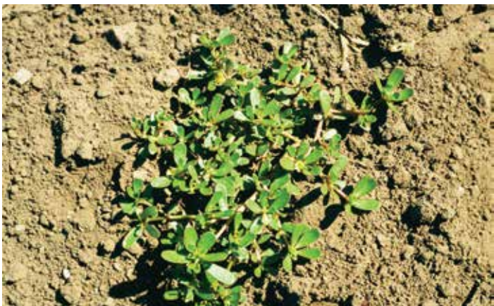
Figure 231. Individual purslane plant.