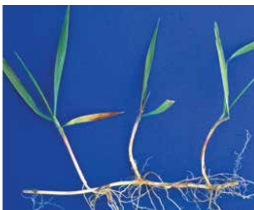
Figure 241. Quackgrass plant and rhizome.