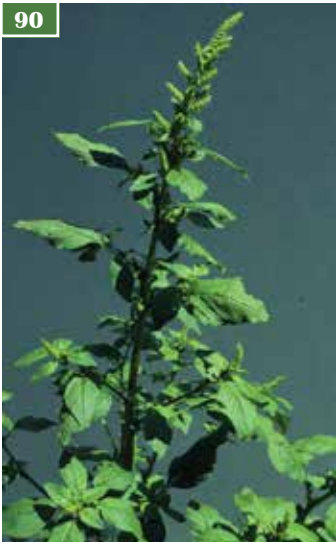
Figure 207. Redroot pigweed. (R. Parker)