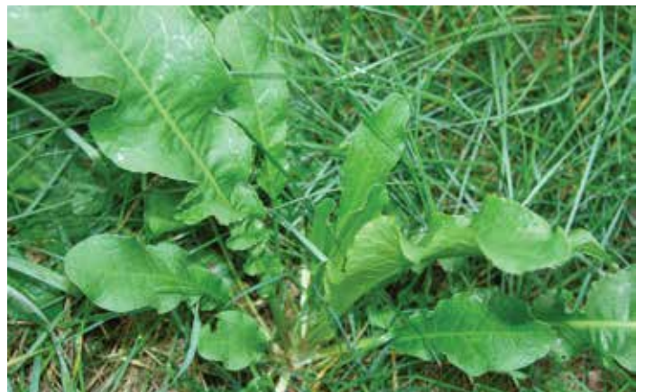
Figure 235. Curly dock. See also mature plant's inflorescence, Fig. 225. (M.A. Goll)