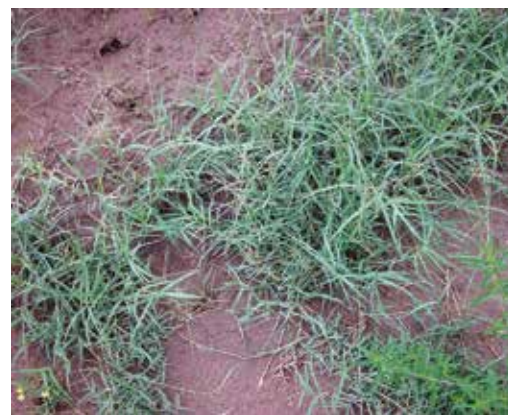
Figure 242. Bermudagrass plants. See also Figure 227. (R. Parker)