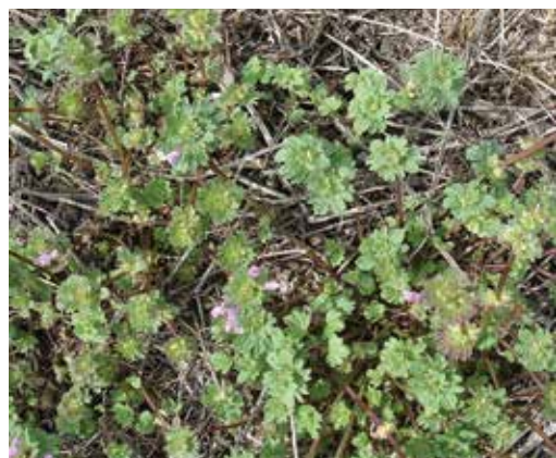
Figure 214. Henbit plant. (R.A. Boydston)