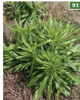
Figure 221. Horseweed plant. (R. Parker)