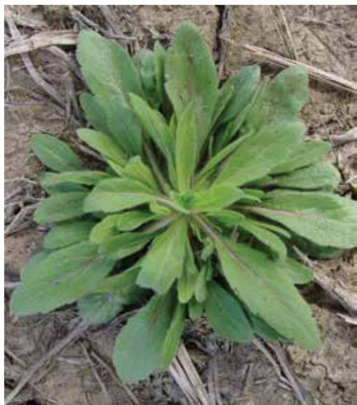
Figure 201. Horseweed seedling. (R.A. Boydston)

◆ Proper weed identification is important for selecting the most effective and economical treatment in the hop yard.