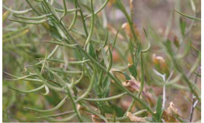
Figure 233. Blue mustard seed pods. (R. Parker)