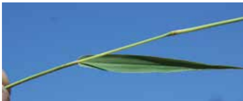
Figure 217. Green foxtail stem with leaf. (R.A. Boydston)