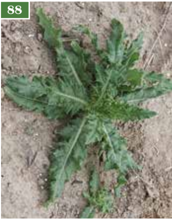
Figure 193. Canada thistle seedling. (R.A. Boydston)