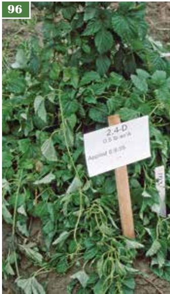
Figure 245. Leaf cupping and stem twisting due to 2,4-D. Notice that upper leaves above the zone of herbicide contact appear healthy.