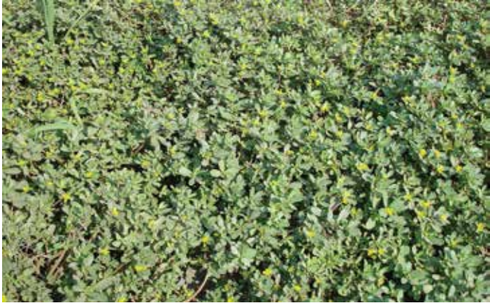
Figure 229. Common purslane plants. (R. Parker)