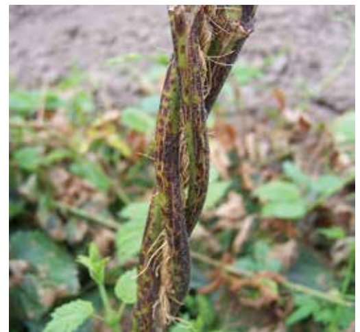
Figure 249. Necrotic spotting on stems due to carfentrazone. (D.H. Gent)