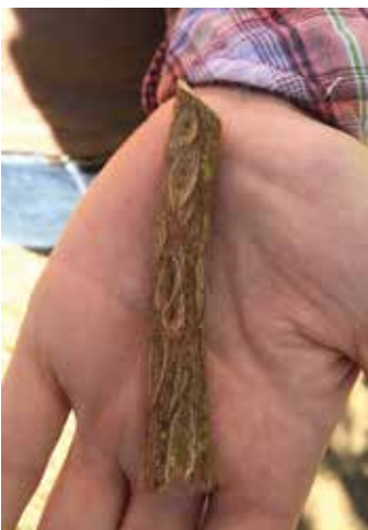
Figure 247. Stem cracking due to carfentrazone. (D.H. Gent)