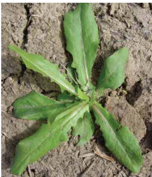
Figure 206. Prickly lettuce seedling.