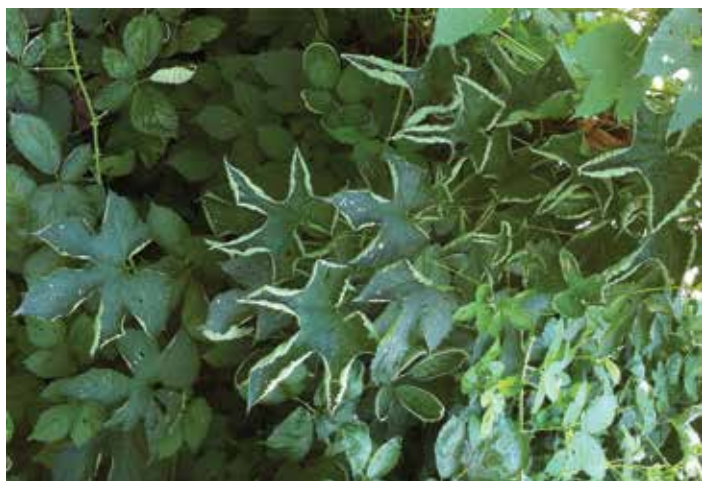
Figure 251. Slight cupping of leaves exposed to clopyralid. Leaf cupping is seldom observed above the zone of spray contact.