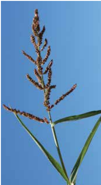
Figure 226. Barnyardgrass is an annual grass weed. (R.A. Boydston)