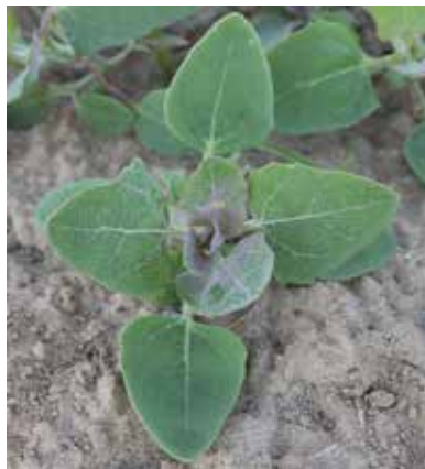
Figure 199. Common lambsquarters seedling.