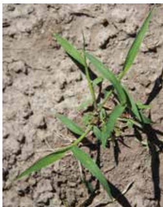
Figure 196. Green foxtail seedling.