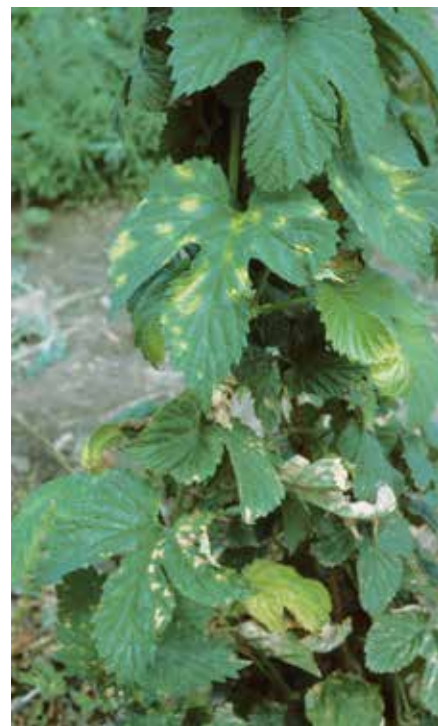
Figure 256. Yellow spots on leaves caused by paraquat drift. (R. Parker)