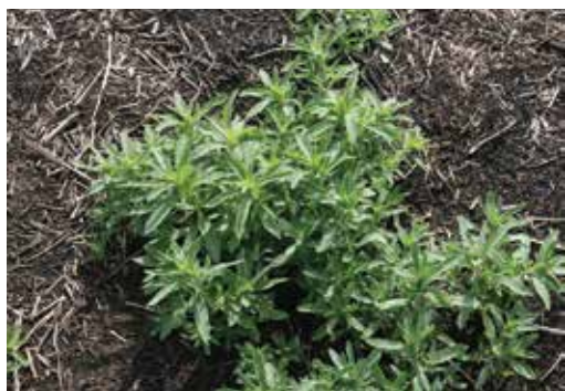
Figure 215. Small kochia plant. See also mature plant, Figure 188. (R. Parker)