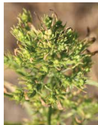
Figure 224. Horseweed buds. (R. Parker)