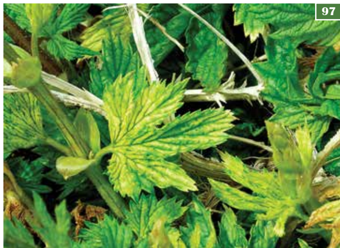
Figure 252. Yellowing and stunting of leaves and shoots caused by a fall application of glyphosate. (M.E. Nelson)