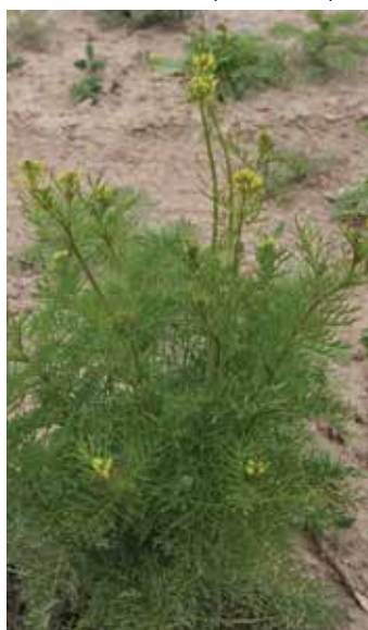
Figure 237. Flixweed plant in flower. (R. Parker)