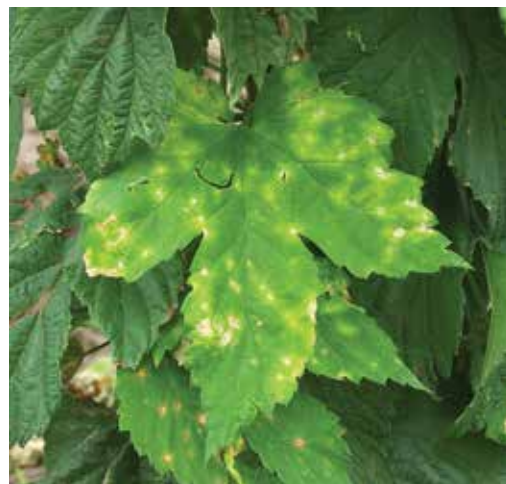
Figure 248. Chlorotic spotting of leaves caused by carfentrazone drift. (D.H. Gent)