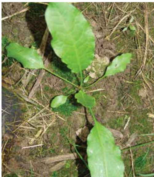
Figure 204. Curly dock seedling. (M.A. Goll)