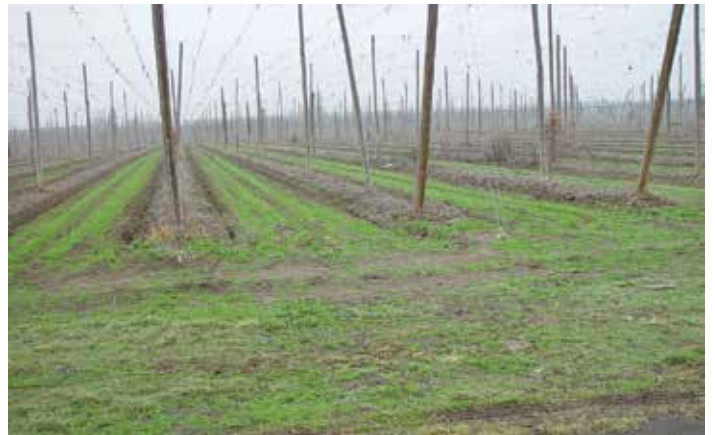
Figure 234. Severe blue mustard infestation. (R. Parker)