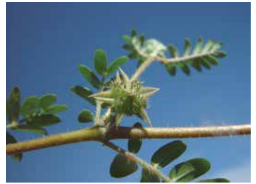
Figure 212. Puncturevine fruit.